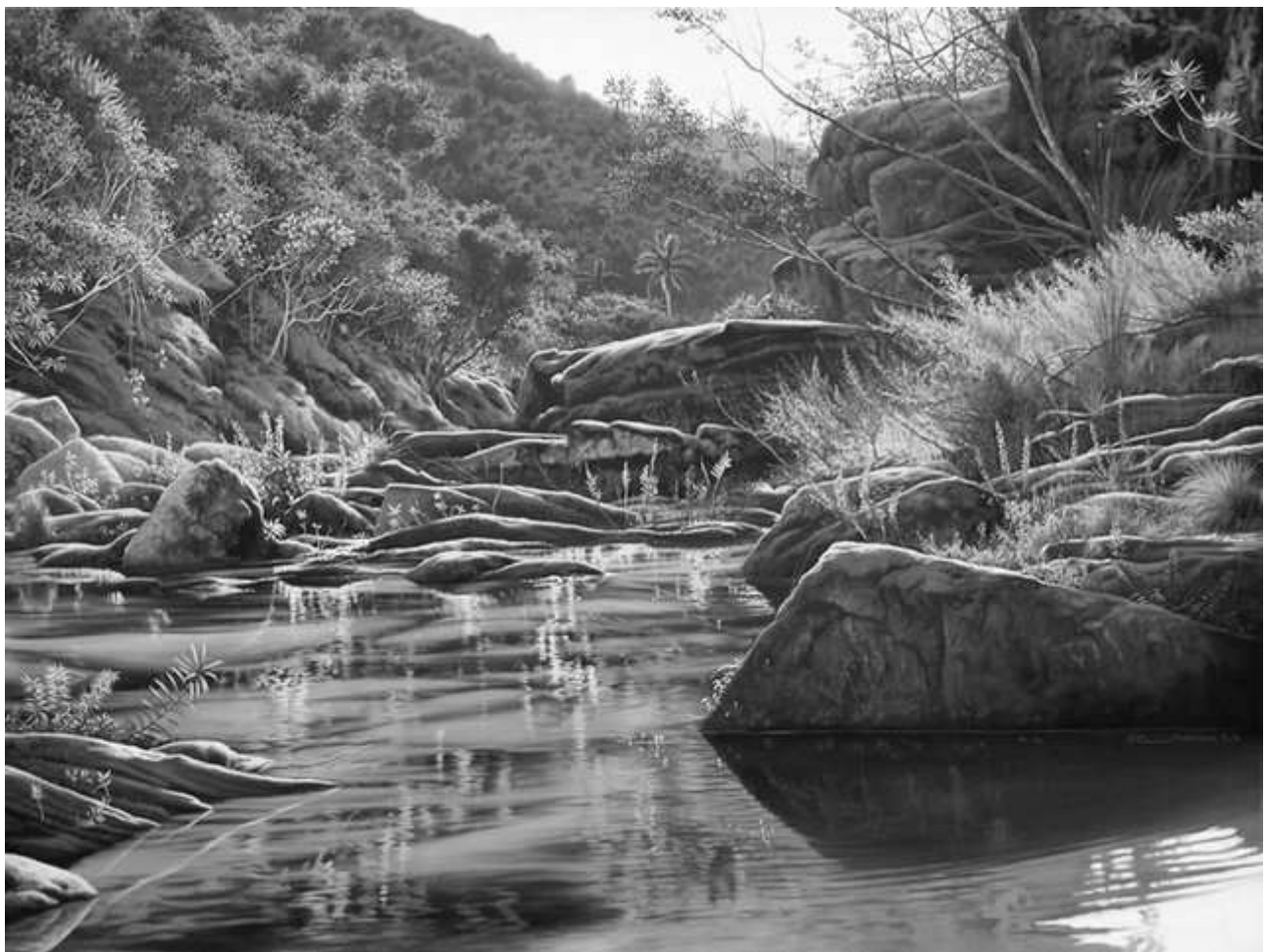
Background image: Giosvany Echeverria , courtesy of Cernuda Arte